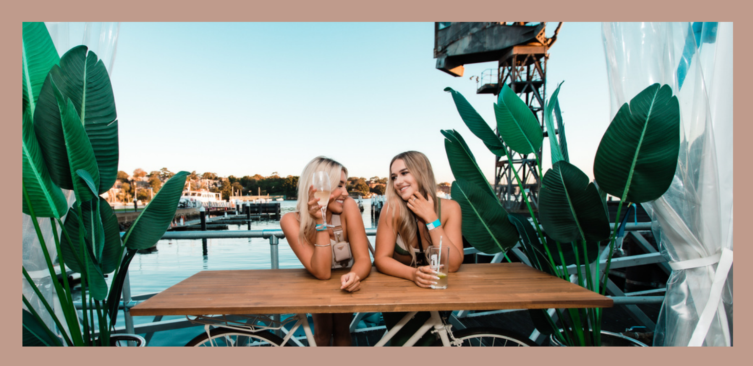
Marina Cafe & Bar reserves the right to decline beverage package options to specific events for Responsible Service of Alcohol.