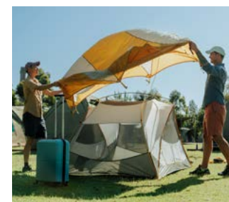
BYO tent option