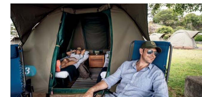
Deluxe waterfront camping package