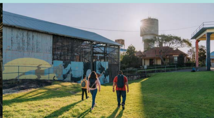
Aboriginal Tent Embassy mural