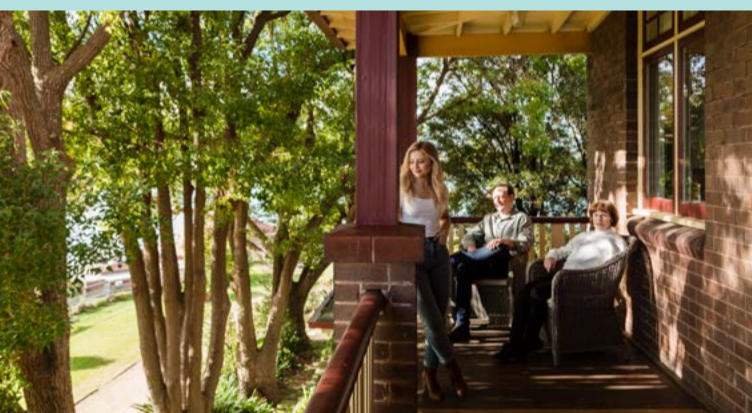
Heritage Holiday House