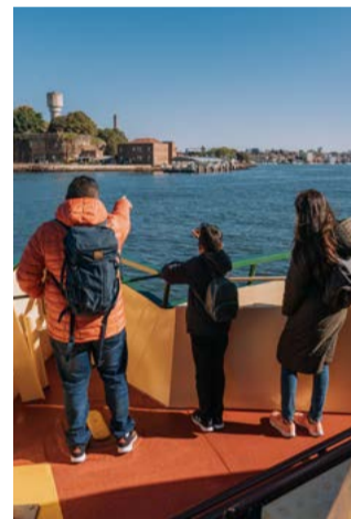
Ferry to Cockatoo Island / Wareamah

You can also visit Cockatoo Island by water taxi, private boat or kayak.