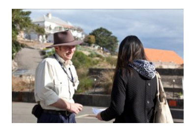
Harbour Trust Ranger c. 2010