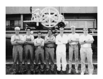
Dockyard workers c. 1980s