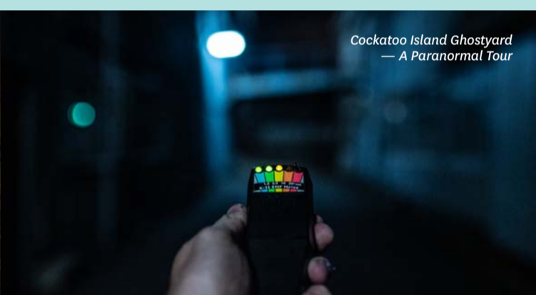
Cockatoo Island Ghostyard — A Paranormal Tour