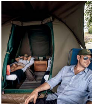
Deluxe Waterfront Camping package