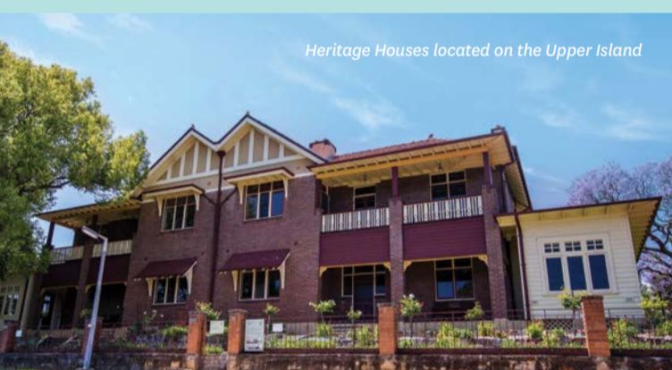
Heritage Houses located on the Upper Island

Visit cockatooisland.gov.au to find out what's on and how to book.