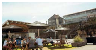
Marina Café & Bar (Dock's Precinct)

Try a great range of burgers, fish and chips, and mezze plates. BBQ packs are also available for campers to order. ( Map ref 7H )