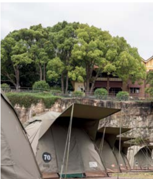
Cockatoo Island's Campground

Includes a pre-erected 3m x 3m tent on the waterfront, two raised single beds with mattresses, linen, sun lounges, an Esky and a lantern.