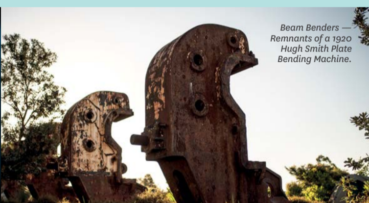
Beam Benders – Remnants of a 1920 Hugh Smith Plate Bending Machine.