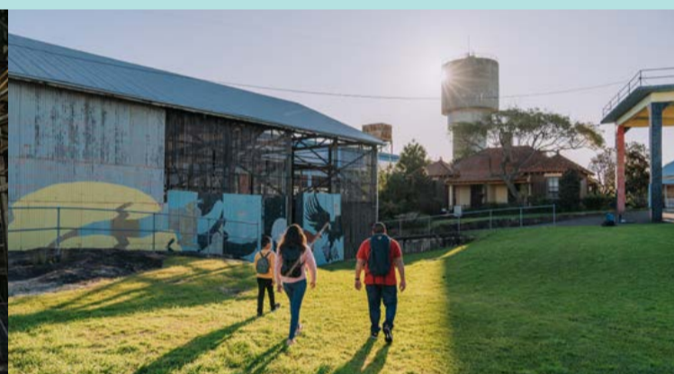
Aboriginal Tent Embassy mural