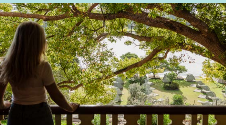
Heritage Holiday House

Learn how Cockatoo Island's dockyard contributed to the Allied war effort during the Second World War. COST: From $16 per person DURATION: 60 minutes WHEN: Private group bookings only. Available by request.