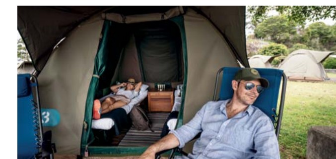
Deluxe waterfront camping package

Looking for a glamping getaway for 2? Our premium waterfront package is perfect for those seeking a slice of luxury.