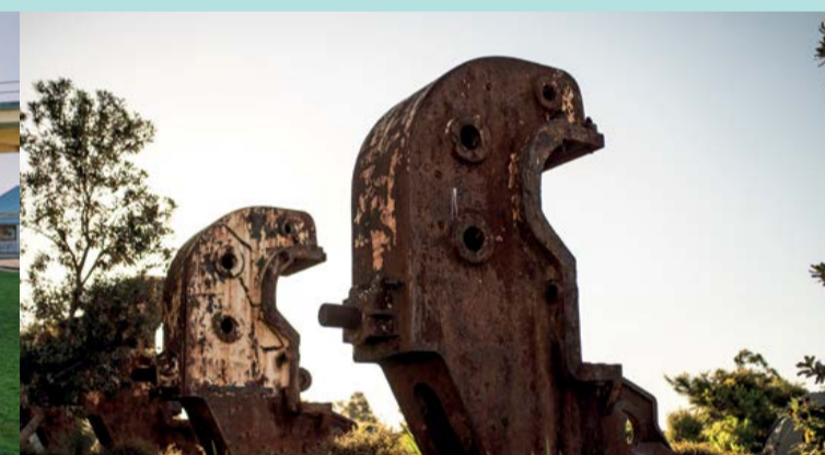
Remnants of a 1920 Hugh Smith Plate Bending Machine

The Sydney Harbour Federation Trust (Harbour Trust) manages extraordinary places on the world's best harbour and provides the public with access to precious bushland, parks and open spaces. Our destinations include Cockatoo Island / Wareamah, North Head Sanctuary in Manly, Sub Base Platypus in North Sydney and the precincts of Headland Park in Mosman – namely, Chowder Bay / Gooree, Georges Heights and Middle Head / Gubbuh Gubbuh. We also protect Woolwich Dock and Parklands, Macquarie Lightstation in Vaucluse and the Former Marine Biological Station at Camp Cove.