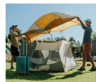
BYO tent option