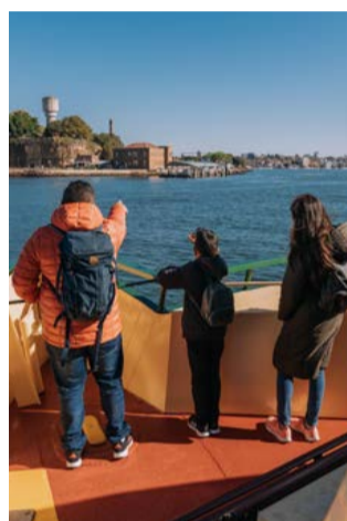
Ferry to Cockatoo Island / Wareamah

You can also visit Cockatoo Island by water taxi, private boat or kayak.