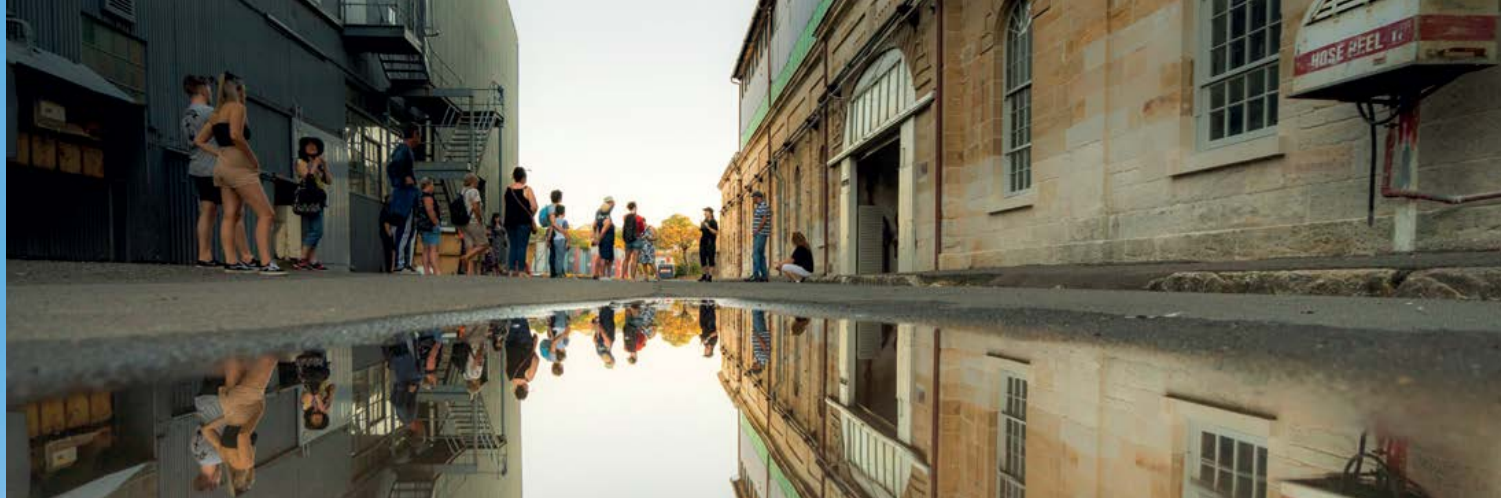
Dark Past Tour