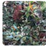
Eastern Suburbs Banksia