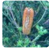
Heath Leaved Banksia