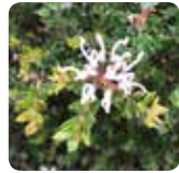
Grey Spider Flower